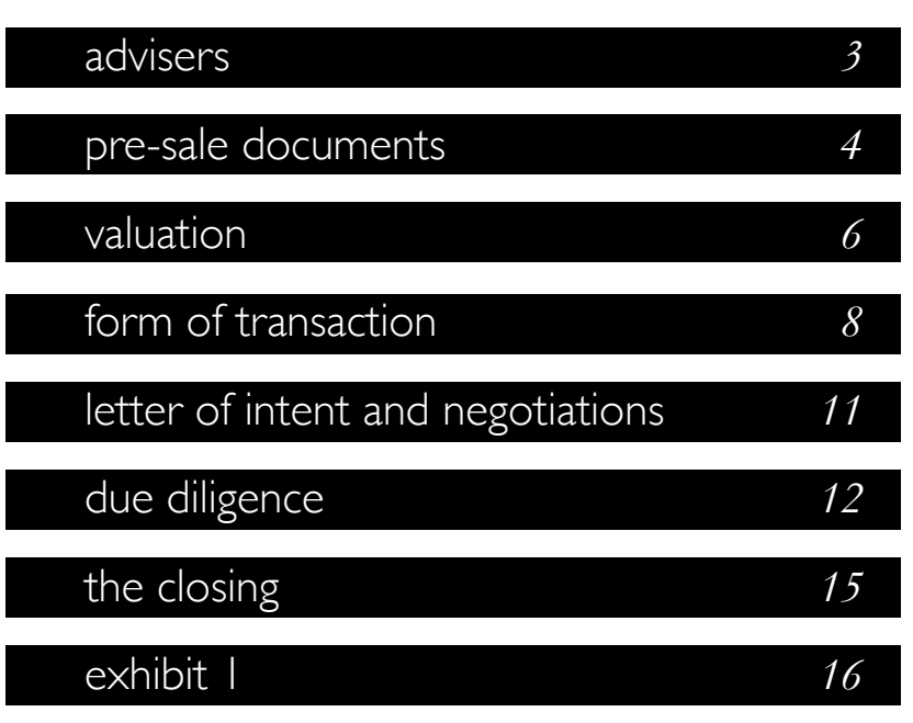
TABLE OF CONTENTS: a timeline for selling your small business

The following guide contains an overview of the key steps and documents involved in the sale of a small business. The table of contents roughly follows the timeline of the transaction.